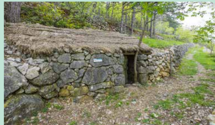
MOŠUNA Suhozidna pastirska kućica (za spremanje ovaca). Dry stone shepherd's shelter (for sheep).

It is a toponym that indicates the water source. Above it, on the cliff bend, there is a pass called Lipica, which by means of a shepherd's path leads to Stara Baška. Also, a nicely renewed dry-stone construction "mrgar" can be seen.